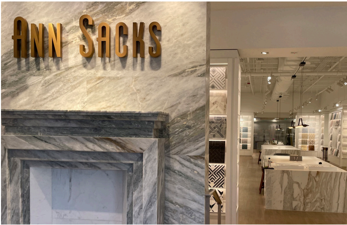
ANN SACKS Nashville, TN

Recently completed projects from around the country.