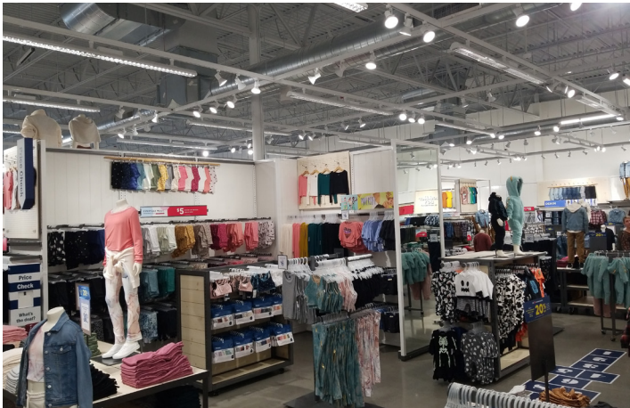
OLD NAVY Louisville, KY