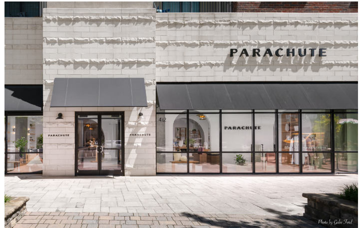
PARACHUTE HOME Nashville, TN