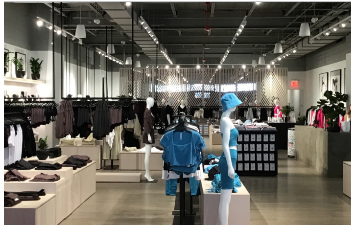
ALO YOGA Oakbrook, IL