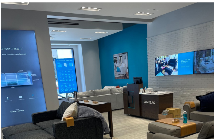
LOVESAC Emeryville, CA