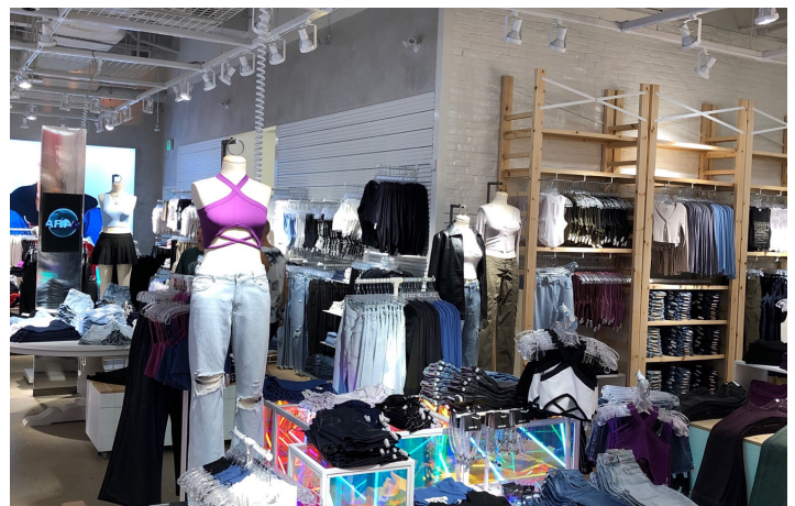
GARAGE Dallas, TX