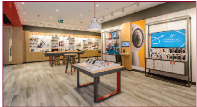
Interior of completed store.

Elder-Jones Construction of Canada, LTD., was the selected general contractor to build the new Rogers Corporate store at Louheed Town Centre in Burnaby, British Columbia. This was Elder-Jones' first project with Rogers. Although Elder-Jones works with US-based cable and TV companies, getting our foot in the door to do the same thing in Canada was challenging and took time and patience, but it paid off with the award of our first project. As for the technical components of the actual build-out, most items including the amount of low voltage wiring required were just like US based Cable and TV stores. However, the requirements in Canada call for only being able to have a certain amount of wire in each run, with