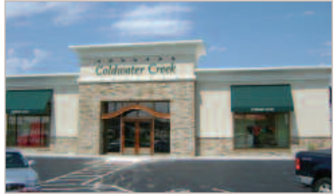
Coldwater Creek , Topeka, KS