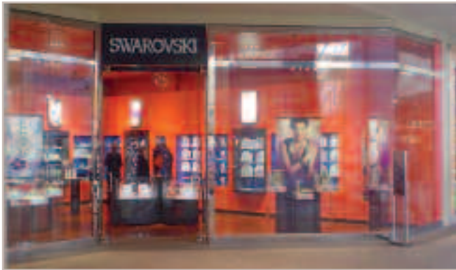
Swarovski , Minnetonka, MN