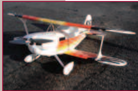
Dave Elstad's Christen Eagle scale model biplane.