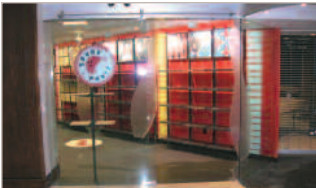
Spare Parts , Arlington, TX