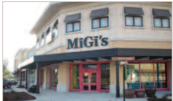
MiGi's , Flowood, MS